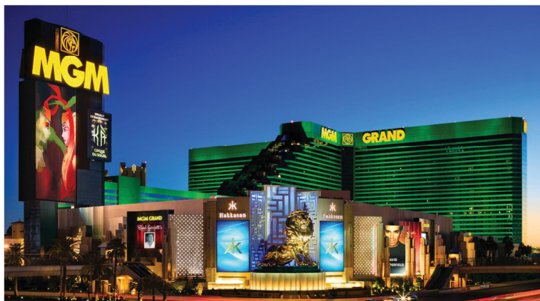
Topgolf - Largest Topgolf facility in the world located at the MGM Grand

Shadow Creek - One of the nation's most exclusive and top-rated golf courses. The course is available exclusively to guests of MGM Resorts International properties in Las Vegas